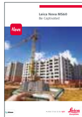
Leica Nova MS60

Illustrations, descriptions and technical data are not binding. All rights reserved. Printed in Switzerland – Copyright Leica Geosystems AG, Heerbrugg, Switzerland, 2015. 836338en – 05.15 – INT