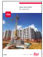
Leica Viva GS15