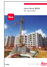
Leica Nova MS60