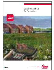
Leica Viva TS16